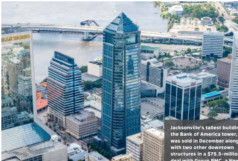
Jacksonville's tallest building, the Bank of America tower, was sold in December along with two other downtown structures in a $75.5-million deal with Group RMC, a New York-based investment group.