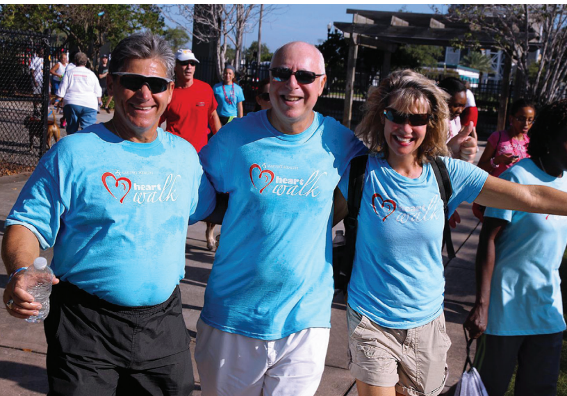
Past and present cardiac rehab participants accept the Heart Walk challenge each September.

If we can help you obtain the necessary physician referral for our cardiac rehab services, call us at 904.202.CARE.